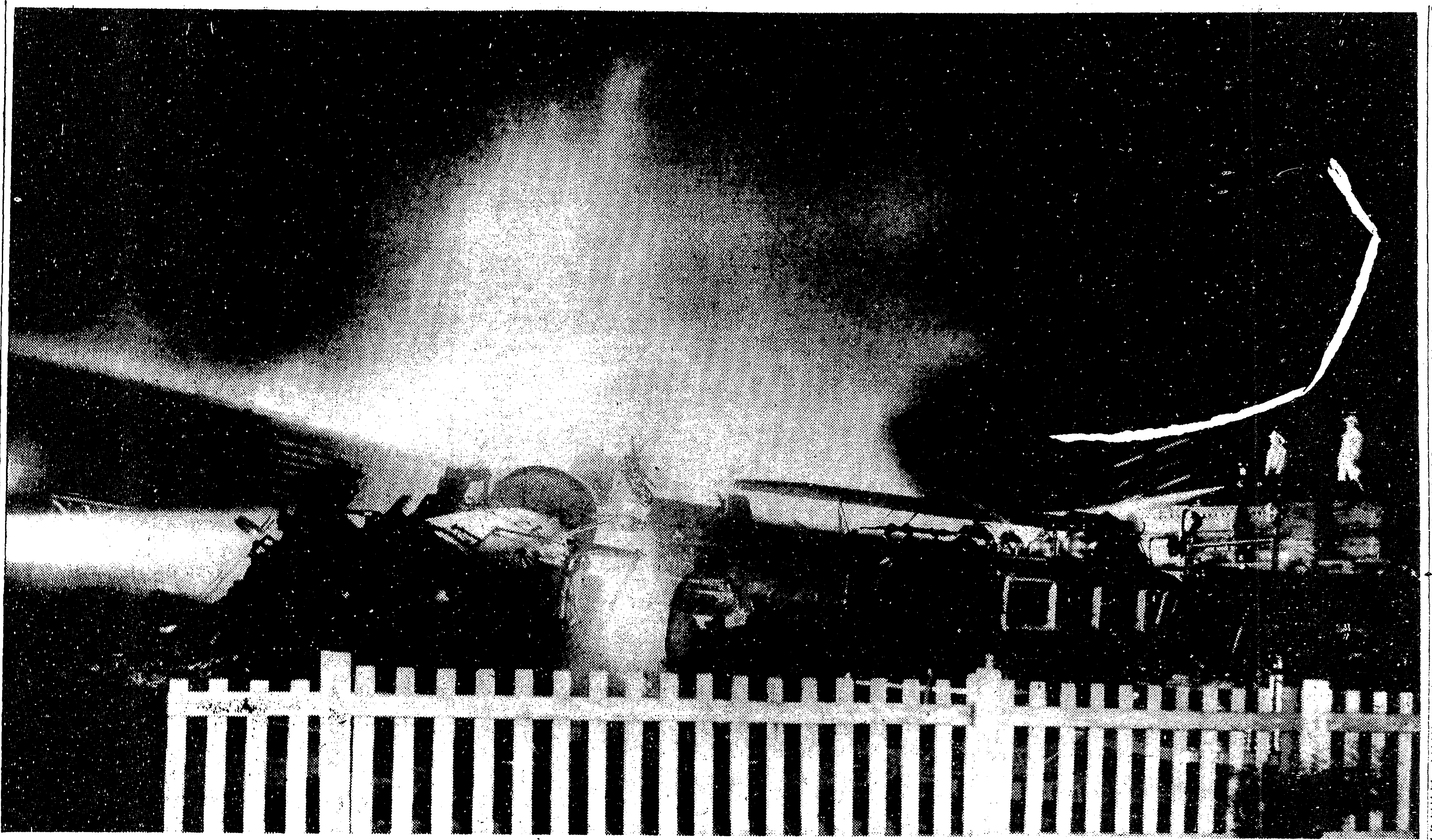
TRAIN WRECKAGE BURNS NEAR COLLEGE PARK —Flames from burning tank cars, overturned amid a wreckage of freight box cars, leap high into the night. Firemen battle the blaze at the scene of the wreck last night on the B. & O. tracks at Lakeland, Md., near College Park. (Story on Page A-1.)

ld en. ver esi- lor- of in- vere day, ed a very note wer re- an- her on- ow of n't er- le- -on tic s- ois /ll- ing as- io- lon ort dal ed es, of er, ia, lor to in en a- nt, ist as in. be ive pe- ey a n- he ut ed or a- as, a ry t- n- ht c- d